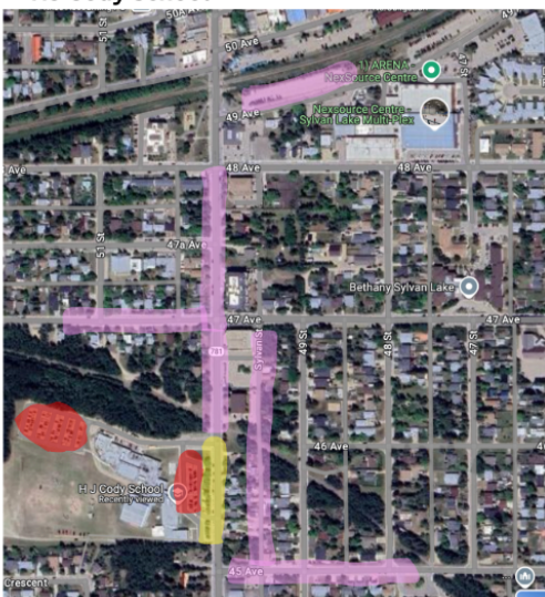
Team drop/pick up: 7:45-8:30am Spectator parking No parking: 7:30-4pm