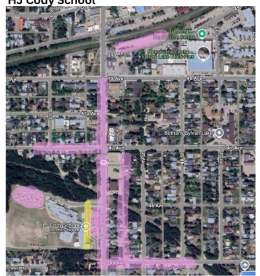
Team drop/pick up Spectator parking